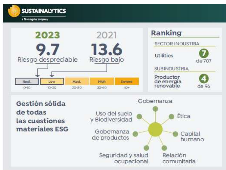
Table: Comparison of Grenergy's results provided by Sustainalytics in 2023.

After thoroughly evaluating the behavior and performance of Grenergy in environmental, social and governance matters, Sustainalytics positively assessed the great efforts made by the Company to improve community relations, invest in human capital as well as health and safety at work, and its governance policies.