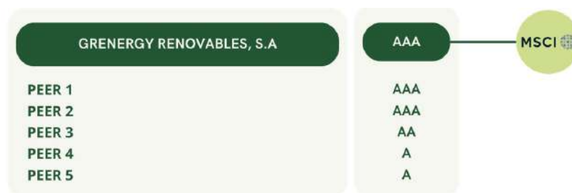
Table: MSCI ESG rating obtained by Greenergy in 2023 in comparison with its peers.