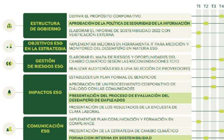
Table: Progress of the ESG Action Plan 2023